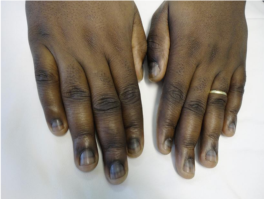
Fig. 1. Nail involvement of all fingers.