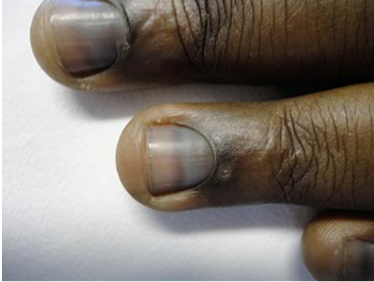
Fig. 3. Close-up of the lesion.