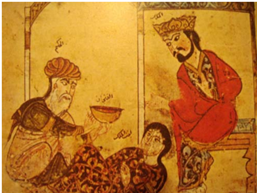
Fig 2: Treatment of a patient by the physician. (8)