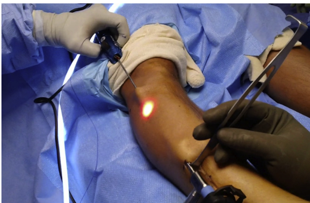
Fig 1. Clinical photograph of the right leg of a patient in the supine position. A 30° arthroscope is placed through a small distal incision. The Spectrum suture passer is then placed through a proximal incision to introduce a No. 1 PDS. The technique used for the anterior compartment is depicted.

Exertional compartment syndrome commonly involves both lower extremities. If so, the contralateral leg anterior and lateral compartments are released in the same fashion. The tourniquet is deflated after both compartments in the respective leg are released, and care is taken to assess for bleeding. The wounds are irrigated, and the skin is closed with No. 2-0 Vicryl (Ethicon, Somerville, NJ) and a running subcutaneous No. 2-0 Prolene suture (Ethicon). Steri-Strips (3M, St Paul, MN) are placed over the Spectrum insertion sites. Cotton is wrapped around the calf, and an ACE wrap (3M) is applied from the foot to the distal thigh to provide compression and reduce the risk of hematoma formation. Dressings are removed on the second postoperative day. Elevation is encouraged to prevent swelling. In bilateral