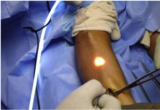
Fig 3. The No. 1 PDS is used for retraction of the skin. This ensures excellent visualization of the fascia and the superficial peroneal nerve with the arthroscope. A similar technique is used for the lateral compartment using the proximal incision that is marked in this clinical photograph.

release situations, crutches are used for 2 weeks in an effort to restrict activity and allow wound healing. At 2 weeks, the sutures are removed and the patient is weaned off crutches. Patients are cautioned to limit their activity until their wounds are completely healed. They can gradually return to full activity in 6 weeks. Our technique is demonstrated in Video 1 .