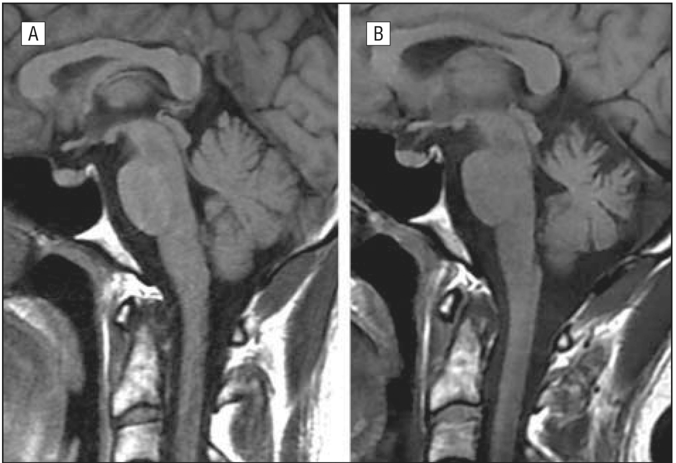
Figure 1. Sagittal T1-weighted sequence of the initial magnetic resonance image showed no cerebellar abnormalities (A), whereas the last brain magnetic resonance image disclosed mild cerebellar atrophy (B).