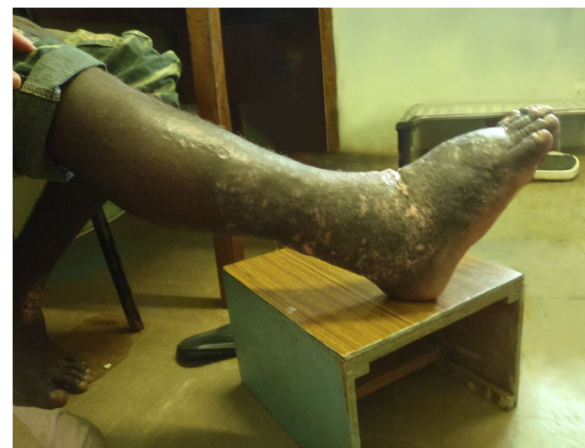
Figure 3 Right leg (lateral). Elephantiasis of right leg of 44 year old male from Alasi, Malaita, Solomon Islands (lateral view).