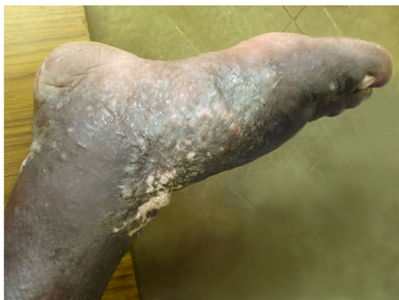
Figure 4 Skin lesions foot. Nodular epidermal changes associated with elephantiasis of right leg (medial view).

may still be occurring in this remote area. Prior to April 2011 the patient had been seen purely as a clinical case and the public health implications had been ignored. However, once the local health professionals were made aware of the programmatic significance of the case, they were adamant that the index case's community be investigated for active transmission of W. bancrofti .