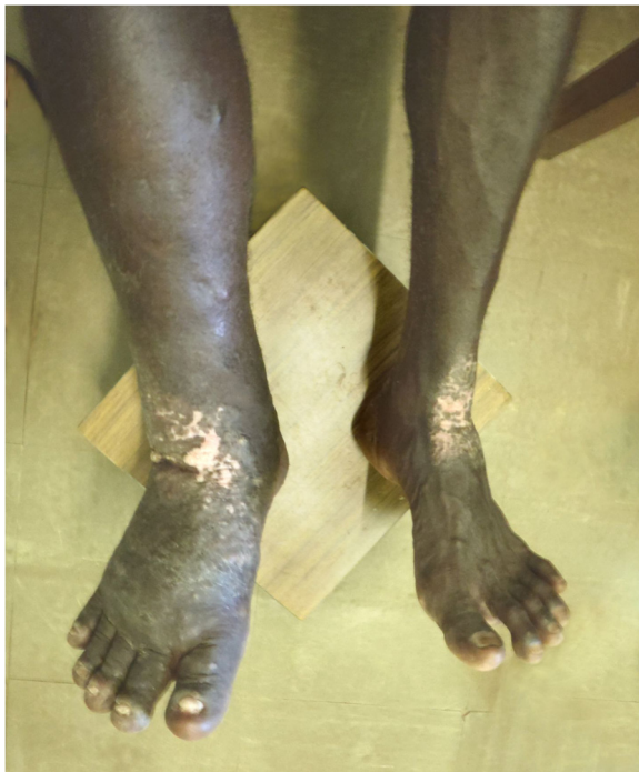
Figure 2 Both legs (anterior). Male 44 years from Alasi, Malaita, Solomon Islands with swelling of right lower leg of 16 months duration. Vitiligo is present on flexor aspects of both ankles and had appeared before the limb swelling.

Although Solomon Islands had been an LF endemic country in the past, in 2011 it was considered to be free of lymphatic filariasis. The case of recent elephantiasis therefore raised the possibility that transmission of LF