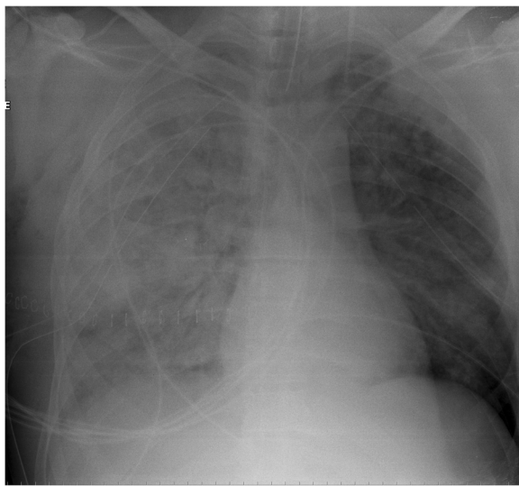
Figure 1 Chest X-ray taken at the admission in the intensive care unit, showing diffuse bilateral lung infiltrates and extensive airspace disease on the right lung.

HFOV has usually been described and used as “rescue therapy” in intractable ARDS with severe hypoxemia, and its use as early ventilatory support for ARDS is not supported by recent clinical trials [7,8]. Despite the description of “early” use (0 to 14 days after injury) of HFOV in trauma patients in retrospective series [4,5], no report of extreme early use has been described.