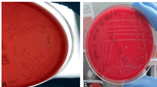
Figure 1. A: Strain Sa29 – B: A typical \beta -hemolytic GBS isolate from our bacteriology lab, Pescara (PE), Italy (Right image from ‘Savini et al. , Group B Streptococcus agalactiae interspecies exchange, Vet Microbiol. 2013 [Epub ahead of print]’).

Nevertheless, given it was a pure culture, we carefully studied it, and surprisingly found it possessed the Lancefield group B antigen (latex test by Liofilchem®, Roseto degli Abruzzi, Italy). Also, after 24 h incubation, the Chromatic Strepto B medium (Liofilchem®) showed green-blue colonies ( Figure 2 ) that are described (in the product package insert) to be formed by GBS (enterococci produce instead purple colonies). In agreement, the Vitek2 system (bioMérieux, Marcy l’Etoile, France) provided identification as S. agalactiae (99% certainty). The isolate was finally deposited into our laboratory collection as S. agalactiae strain Sa29.