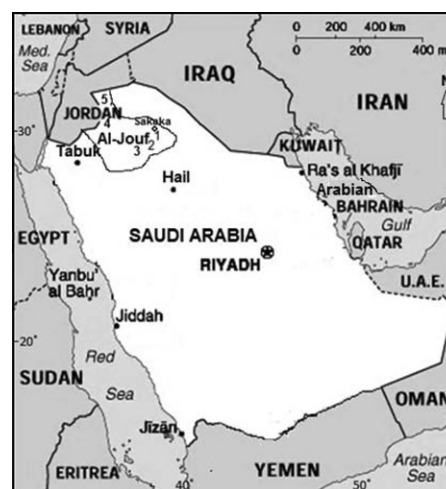
Figure 1 Map of Saudi Arabia showing the study area and the sampling locations (1, Sakaka; 2, Dawmat Al-Jandal; 3, Abo Ajram; 4, Tabarjal; 5, Al-Qurayat).

The study area is characterized by dry climate with hot summer and cool winter. According to the records of Al-Jouf