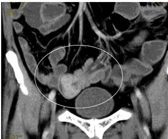
Fig. 1. Abdominal CT scan showing small bowel intussusception.

the intussusception (Fig. 2). A wedge resection of 25 cm of the small bowel and mesentery was carried out, with a hand sewn end-to-end anastomosis. All other visceral organs appeared normal.