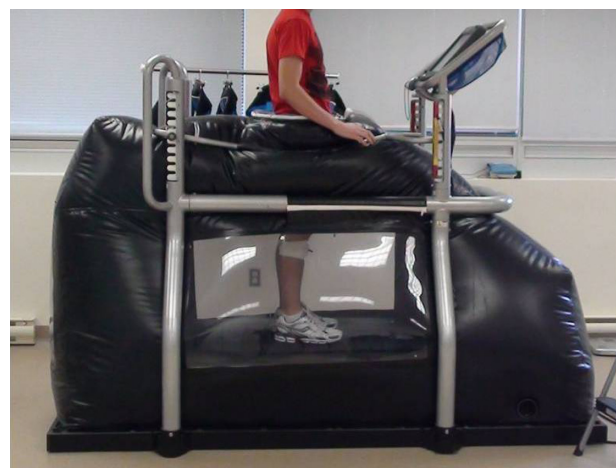
Figure 1 Subject walking on a G-Trainer treadmill under lower body positive pressure support.

Recently, a new treadmill (G-Trainer ® treadmill by AlterG Inc, Fremont, CA, USA) (Figure 1) was introduced that permits low-load walking using an emerging technology called LBPP. 27 The system utilizes a waist-high air chamber