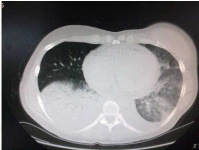
Figure 2. CT Scan before posaconazole treatment.