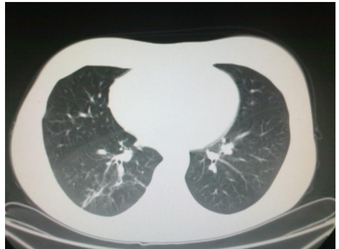
Figure 3. Resolution of the infection.