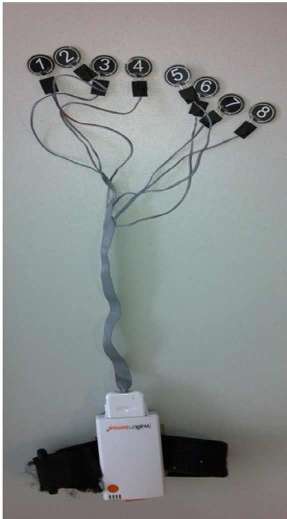
Figure 2 Walkinsense equipment. Sensors are 1 cm 2 and <1 mm thick.