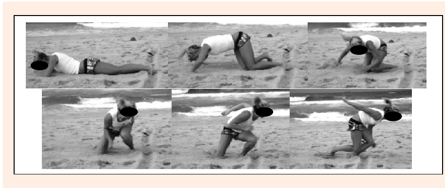
Figure 3. Sequence of a typical beach flags start for young adult sprinters.