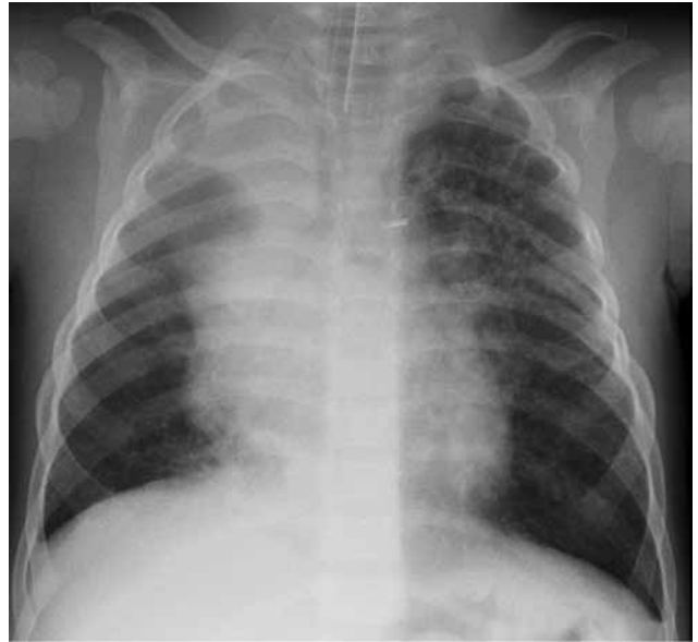
Figure. Chest radiograph of the index patient, a 16-month-old boy in Finland with human bocavirus 1 pneumonia, on day 2 of hospitalization. Bilateral pulmonary infiltrations and atelectasis of the upper right lobe can be seen.

During the acute phase of HBoV1 infection in the index patient, HRV RNA was identified in the NPA of 3