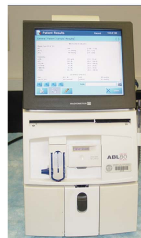
Figure 2 The Radiometer ABL80 Flex Blood gas analyzer.

BCNC rats were repeatedly used for blood gas analysis. Six validated blood samples were collected for venous and arterial measurements;