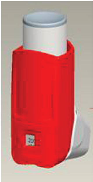
FIGURE 2.— Integrated dose counter on a metered-dose inhaler. Shown here is a ProAir ® metered-dose inhaler (manufactured by Teva Pharmaceutical Industries, Ltd., Horsham, PA).

economic burden of asthma management is already considerable. In 2009, the estimated annual expenditure related to health care and lost productivity due to asthma was more than $20 billion according to the National Heart, Lung, and Blood Institute (28). Nevertheless, dose counters may reduce health care costs by decreasing asthma-related morbidity and attendant medical costs (14,17). For example, inhalation of rescue medication rather than propellant to control acute bronchospasm and quell acute asthma symptoms may avoid the cost of an emergency room visit (29).