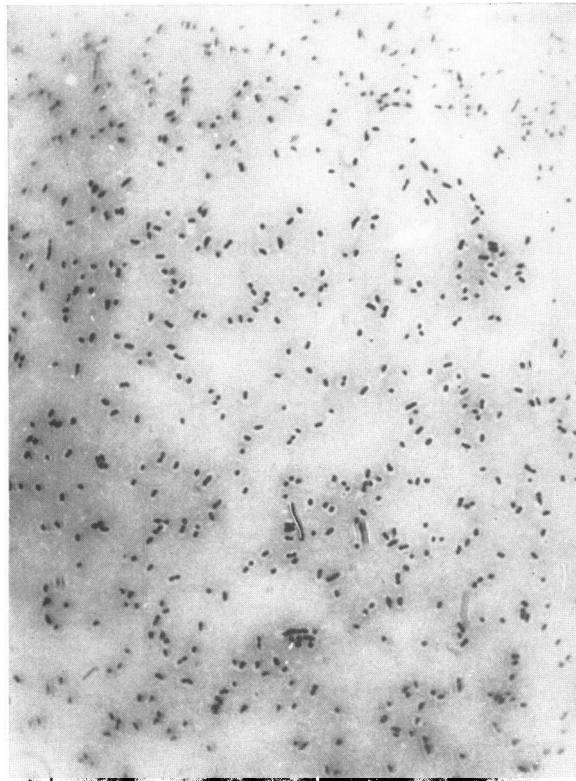
FIG. 2. PASTEURELLA SEPTICA STAINED WITH CRYSTAL VIOLET 30 SECONDS