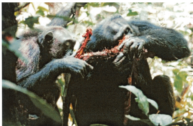
FIG. 1. After hunting and killing a red colobus monkey ( P. badius ), chimpanzees consume almost all parts of their prey.

ses. Primers SK43 (12) and LTR R6 (4) derived from the prototype HTLV-1 sequence ATK (23) were used in the primary PCR to amplify a 1.4-kb fragment from the 3' end of the PTLV-provirus genome. The internal primers X (CAGATGCAATGACCATGAG) and H (TTCAGGAGGCACCACAGGC) were used for nested or seminested PCR analyses combining primers X with LTR R6 and SK43 with H. PCR conditions for first-round PCR and for seminested PCRs were used as previously described (13). From all serologically positive chimpanzees and from two red colobus monkeys a PCR product was obtained (Table 1). The env region from three chimpanzees and one red colobus was successfully amplified by using the primers S3 (CCTCAAGCGAGCTGCATGCCC) and SK44, followed by a nested PCR with the primers S4