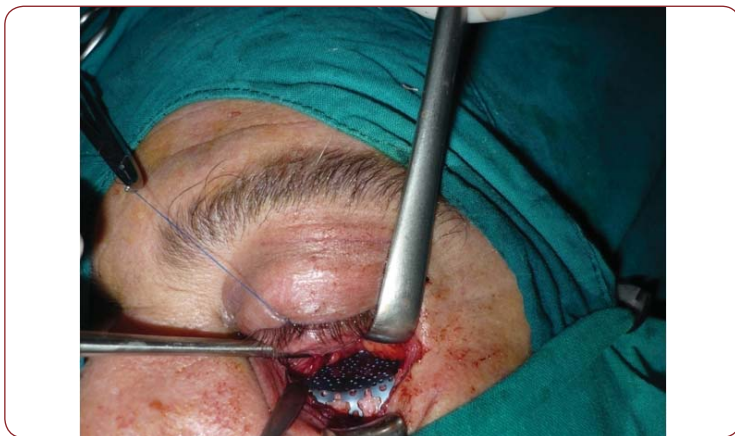
FIGURE 3. Orbital floor reconstruction.