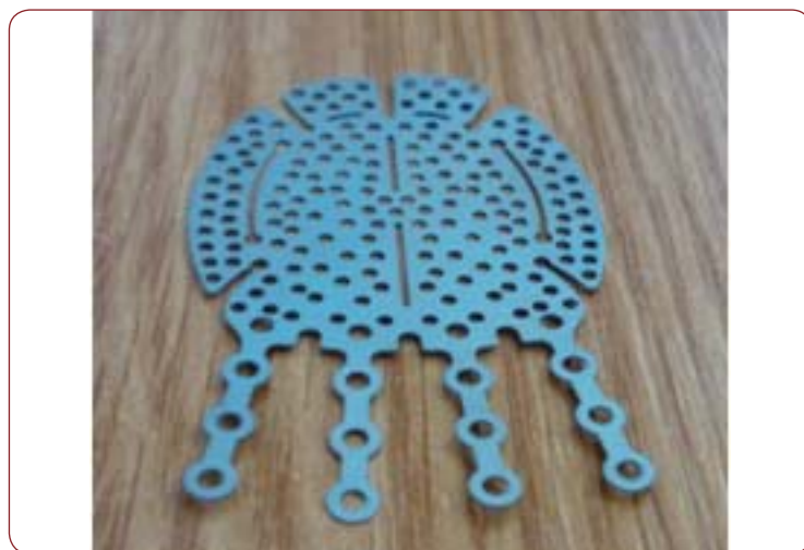
FIGURE 1. Titanium preformed floor plate.

In the past, the use of autogenic bone has been the gold standard in orbital wall reconstruction. Usually calvarial bone was used due to maximal biocompatibility and low cost. However, the harvesting of autogenous bone is associated with donor site morbidity, variable degree of resorption, prolonged total operating time, postoperative pain, scarring. Also autologous bone grafts are usually rigid and cannot be bend to match the concave-convex shape of