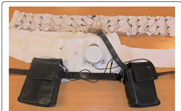
Figure 1 Vibrotactile feedback device. The vibrotactile display, elastic corset, IMU, PC104, and battery pack.

Post-processing was performed using MATLAB (MathWorks, Natick, MA). The IMU raw data was low-pass filtered using a 4th order Butterworth filter (filtfilt.m). Gait initiation and termination were excluded prior to calculating all parameters. The root-mean-square (RMS) of M/L and A/P tilt and overall sway was calculated over a fixed distance for each trial. Percentage of time spent in each of the tactor activation zones (null, low, high) was also calculated on a trial-by-trial basis. Pacing information was approximated from the number of hand-counted gait cycles and the sampling rate. Individual repetitions comprising sets of similar display configurations were averaged