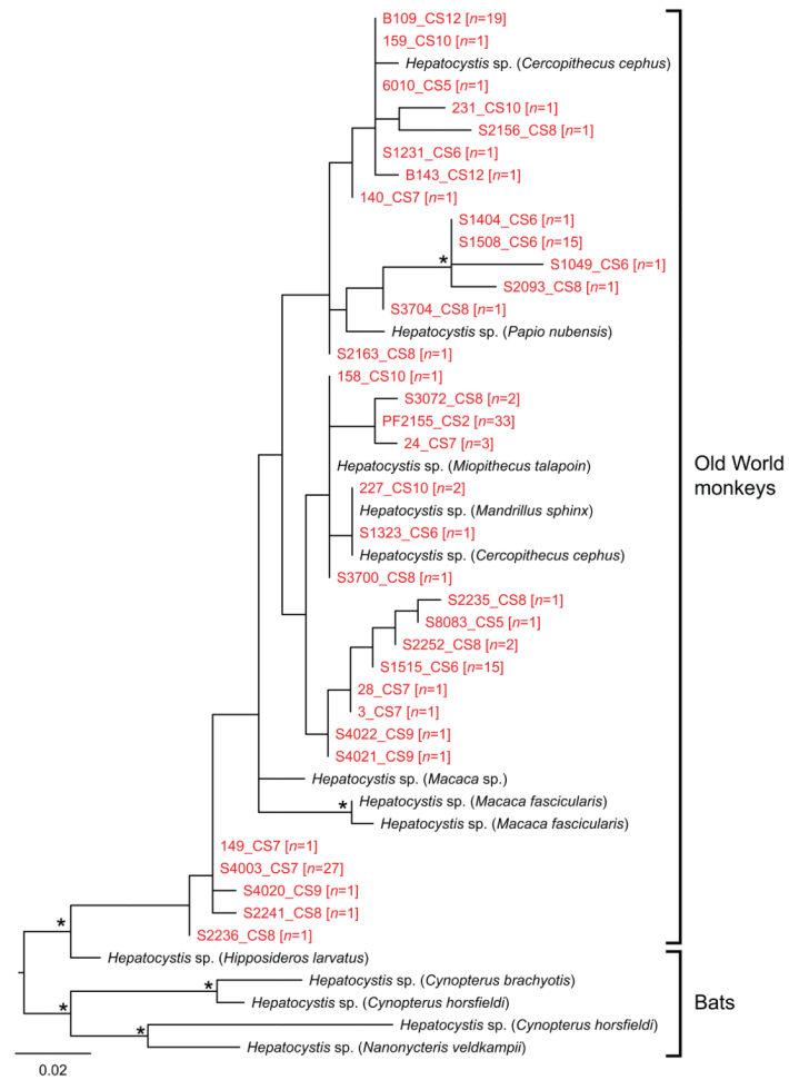
Fig. 3. Evolutionary relationships of Hepatocystis parasites. A maximum likelihood tree of mitochondrial cytb sequences (201 bp) is shown. Hepatocystis reference sequences are shown in black, with their respective host species indicated in parentheses; newly derived sequences from greater spot-nosed monkey samples are highlighted in red (the number of sequences with the same haplotype is shown in parentheses). Asterisks on branches indicate bootstrap support values \geq 70\% ; the scale bar represents 0.02 nucleotide substitutions per site. GenBank accession numbers for all sequences are listed in Supplementary Table S1.