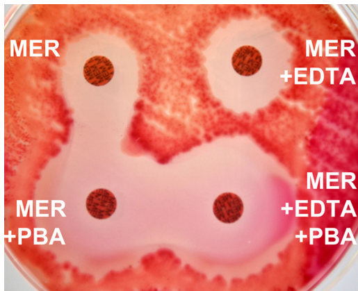
FIG 1 Appearance of a CDT positive for KPC-producing CPE. Inhibition zone diameters were 19 mm for the meropenem (MER) disk, 20 mm for the MER disk + EDTA, 29 mm for the MER disk + phenyl boronic acid (PBA), and 31 mm for the MER disk + PBA + EDTA. MEM, meropenem 10 mg.