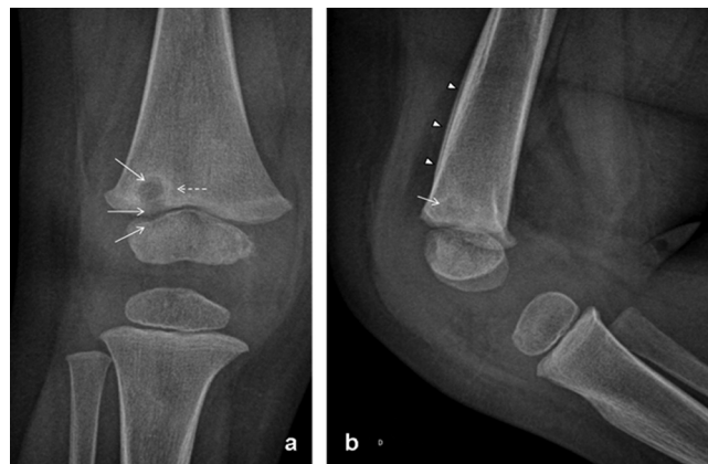
FIG 2 Knee X-ray analyses (anteroposterior [a] and lateral views) demonstrate a round lytic lesion (arrow) circled by a well-defined sclerotic margin (dotted arrow), located in the inferior metaphysis of the femur, adjacent to the physis (arrow). The lateral view also shows a unilamellar inferoanterior periosteal reaction (arrowhead).

With optimization of conventional culture and development of current molecular techniques, such as real-time PCR, K. kingae has become the major pathogen of OAI in children under 4 years of age in several countries (1, 6, 7). Lower limb joints are most frequently infected, with hips and knees involved in 60% and 80% of septic arthritis cases, respectively (8, 9). Osteomyelitis is also a common presentation of K. kingae infections, and lower limbs are involved in 65% of cases (8). Soft tissue reactions have already been described to occur among children with K. kingae OAI (10), such as presternal tumefaction associated with sternum osteomyelitis (11, 12). However, to our knowledge, only one K. kingae soft