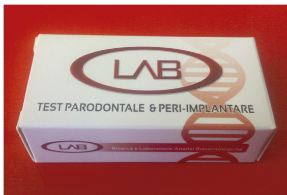
Figure 1. LAB®-test kit.

Occurrence and amount of red complex bacteria from crevicular fluid were evaluated in 146 individuals. A single specimen from each patient was analyzed by quantitative real time PCR (LAB test LAB® s.r.l, Ferrara, Italy) (Figs. 1, 2), obtaining measures of total bacteria load and of three species involved in periodontitis, i.e. P. gingivalis , T. forsythia , and T. denticola . Here we report a preliminary study focused mainly on prevalence