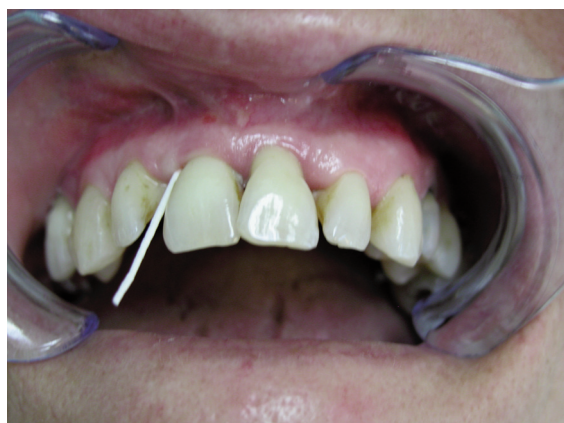
Figures 2 Method of sampling bacterial DNA.

of these three species among groups of patients with different diagnosis - regardless of different clinical aspects that may describe severity of the disease – in order to understand whether the presence of the red complex species and their relative amount may be considered predictive factors of periodontitis.