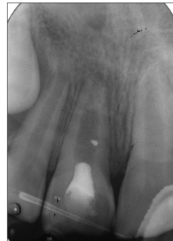
Figure 2: Five months periapical radiograph showed thickening of lateral dental walls and increased root length