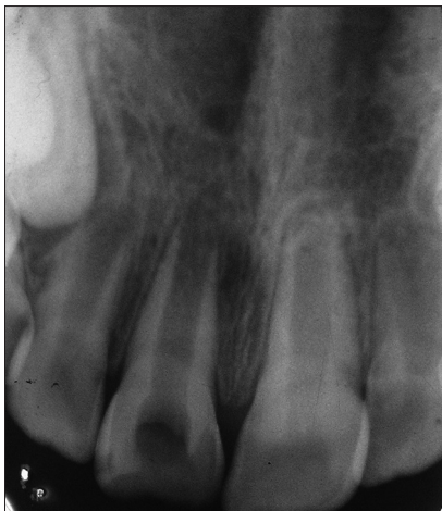
Figure 1: Intraoral periapical radiograph of 11 showing incompletely formed apex with periapical rarefaction

The child was called after every 3 months for clinical examination and radiographic evaluation. Five months radiograph showed thickening of lateral dental walls, increased root length [Figure 2]. Nine months radiograph showed increased root length, complete apical closure and thickening of lateral dental walls [Figure 3]. Thereafter, the tooth is under follow-up of 15 months without any signs of endodontic failure clinically and radiographically [Figure 4].