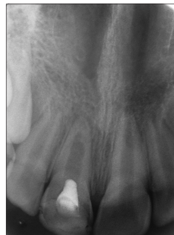
Figure 4: Fifteen months follow-up periapical radiograph showing no signs of endodontic failure