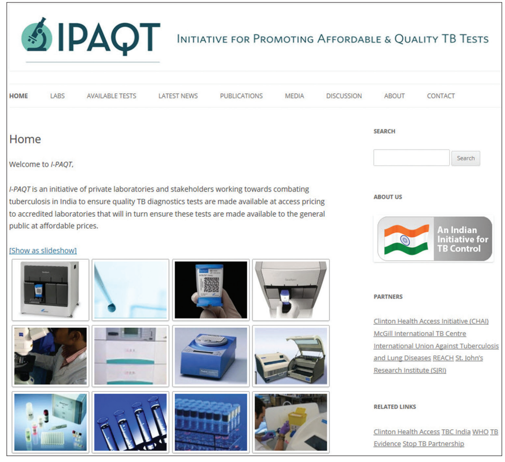
Figure 2: Web site of the initiative for promoting affordable, quality TB tests initiative (www.ipaqt.org)

Since its launch in March of 2013, the IPAQT initiative has already achieved a pan-India presence-with 42 labs which encompasses over 3000 franchisee labs and greater than 10,000 collection centers committed to providing these tests at affordable prices [Figure 2]. The number of labs is expected to increase significantly in the