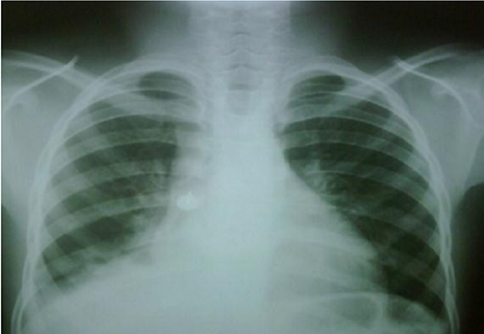
Figure 1: Chest Radiogram of drawing pin in the right main bronchus