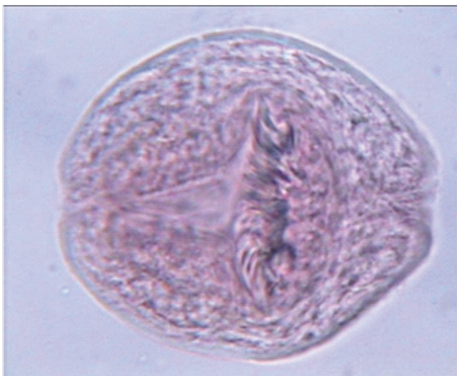
Figure 2. Dead protoscolices with absorbed dye (after treatment with chitosan).