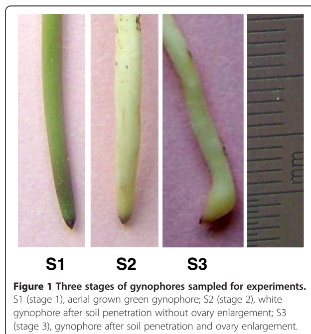
Figure 1 Three stages of gynophores sampled for experiments. S1 (stage 1), aerial grown green gynophore; S2 (stage 2), white gynophore after soil penetration without ovary enlargement; S3 (stage 3), gynophore after soil penetration and ovary enlargement.

A total number of 13293536 reads corresponding to about 120 millions (1196418240) of nucleotides were generated by high throughput sequencing of the gynophore cDNA pool using Illumina HiSeq™ 2000. The raw reads that only have 3' adaptor fragments were removed before data analysis. Short sequences assembly was performed using SOAPdenovo assembling program to form contigs and scaffolds [17]. More than 353 thousand contigs were