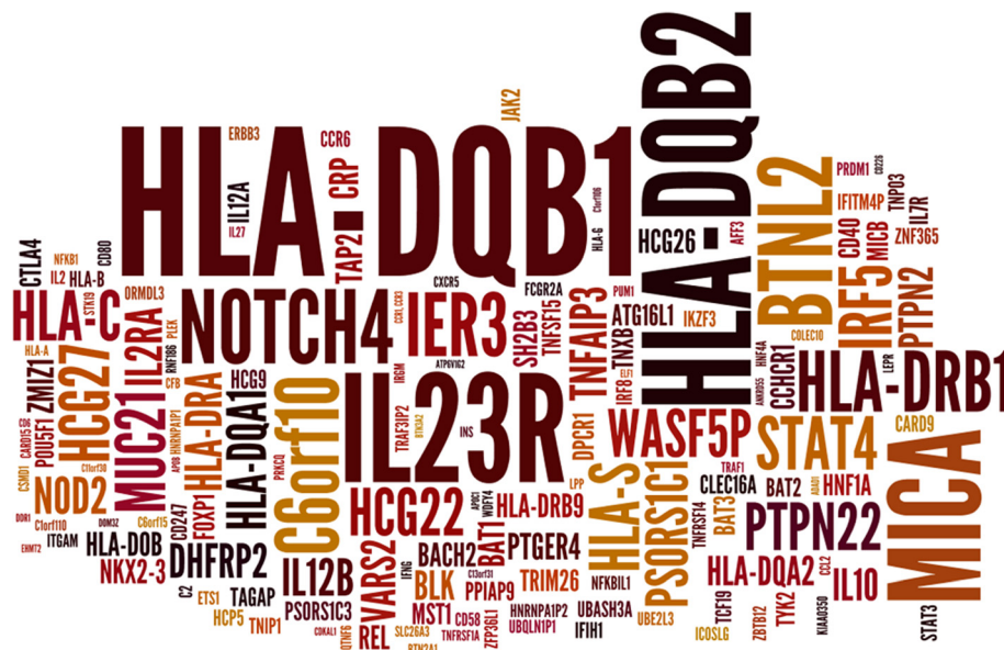
Figure 2 Weighted list created from the reported significant mapped genes in the current genome-wide association studies curated from the National Human Genome Research Institute and the database of genotypes and phenotypes. The word cloud shows the frequency of genes and its associated variants relative to their font size using a freely available java applet [24]. Both databases (accessed April 2013) [25,26] were queried taking into account P-values reported for the genetic variants associated with autoimmune disease. For the National Human Genome Research Institute, a total of 12,064 genetic variants were encountered, out of which 1,370 were variants significantly associated with autoimmune disease susceptibility. In the database of genotypes and phenotypes, out of 31,246 reported variants, 972 were mutually exclusive from the National Human Genome Research Institute, for a grand total of 2,342 genetic variants related to genes associated in a genome-wide association study of any population. The autoimmune diseases of interest were autoimmune thyroid disease, Behcet's disease, celiac disease, rheumatoid arthritis, inflammatory bowel disease, juvenile rheumatoid arthritis, Kawasaki disease, multiple sclerosis, primary biliary cirrhosis, primary sclerosing cholangitis, psoriasis, systemic sclerosis, systemic lupus erythematosus, type 1 diabetes and vitiligo.

dissect variants either associated or co-segregating with ADs (that is, association or linkage approaches such as family-based co-segregation analysis) [9,15]. For association studies, two approaches are available: genome-wide association studies (GWAS) and candidate gene studies. The genome-wide association approach is usually hypothesis-free whereas the candidate gene is hypothesis-driven.