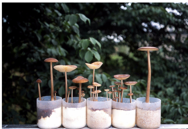
Fig. 2. The fruiting bodies of Oudemansiella radicata on sawdust media of Q. variabilis mixed with 10% rice bran.

Although fruiting bodies of 9 strains have been produced widely on oak sawdust media mixed with rice bran of 5 to 30%, the contamination of oak sawdust media