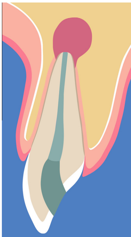
Figure 1 Schematic illustration of a lesion limited to the periapical area.

(case report OR case reports) NOT (in vitro) AND (regenerative technique OR guided bone regeneration OR guided tissue