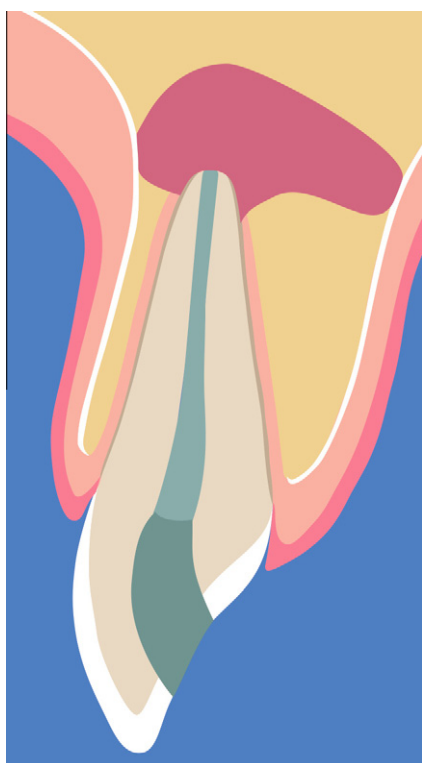
Figure 2 Schematic illustration of a through-and-through (tunnel) lesion.

(case report OR case reports) NOT (in vitro) AND (regenerative technique OR guided bone regeneration OR guided tissue