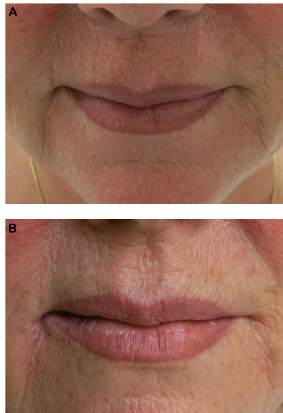
Figure 5 A 60-year-old woman with flattening of Cupid's bow and downward turn of the commissures.

In a multicenter European trial, 22 60 subjects were treated with the HA filler Juvederm Vobella (Allergan). This new