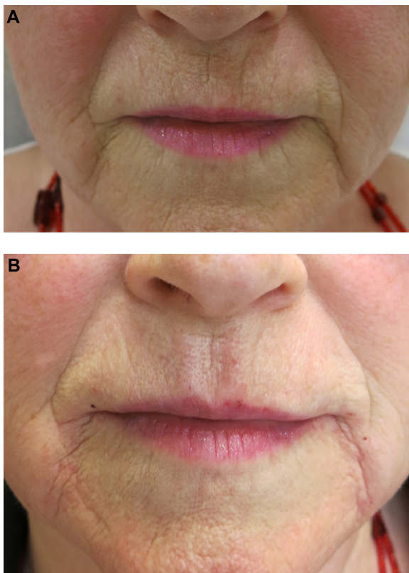
Figure 6 A 68-year-old woman with flattening of Cupid's bow, thinning of white rolls, perioral fine lines, and marionette lines.

Notes: (A) Before treatment lip fullness scale 0 (upper lip) and 1 (lower lip); marionette line grading scale 4 (left side) and 3 (right side). (B) After treatment with hyaluronic filler showing restoration of upper lip vermillion borders and philtrum collumelas by 1 mL Juvederm ultrasmile and marionette lines by 2 mL Belotero basic. Lip fullness scale 1 (for upper lip; lower lip left untreated) and marionette line grading scale 1 (for both sides). Asymmetries have been corrected.