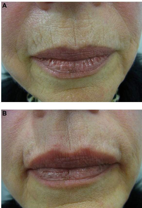
Figure 4 A 67-year-old woman with perioral fine lines and flattening of philtrum collumelas.

Notes: (A) Before treatment lip fullness scale 2 and marionette line grading scale 2. (B) After restoration of collumelas and volumizing of the white roll (upper lip) along the vermillion border with 2 mL Juvederm ultrasmile, lip fullness scale 4 (upper lip), marionette line grading scale 1. There is improvement of fine lines as well.