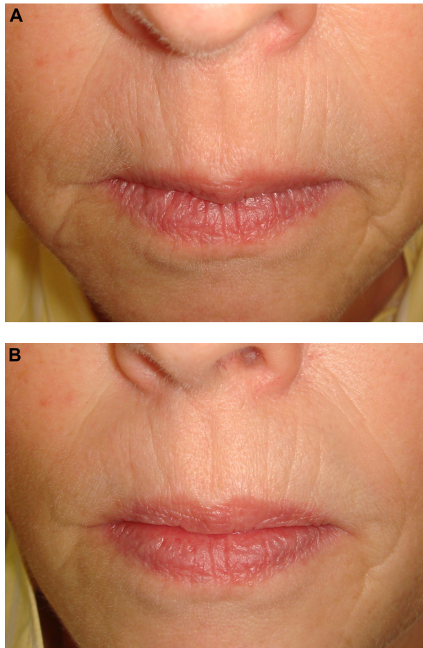
Figure 2 A 55-year-old woman with thin lips and perioral fine lines and elongation of the philtrum.

Notes: (A) Before treatment lip fullness scale (LFS) 0 (upper lip) and 1 (lower lip); marionette line grading scale 1. (B) After liquid lift for the cheeks with 2 mL Juvederm voluma, the perioral region has been remarkably improved. The marionette lines smoothed and the upper lip LFS increased by 1 scoring grade. The whole perioral area remained untouched by the filler. This example underlines the importance of the nasolabial fat pad for upper lip aesthetics.