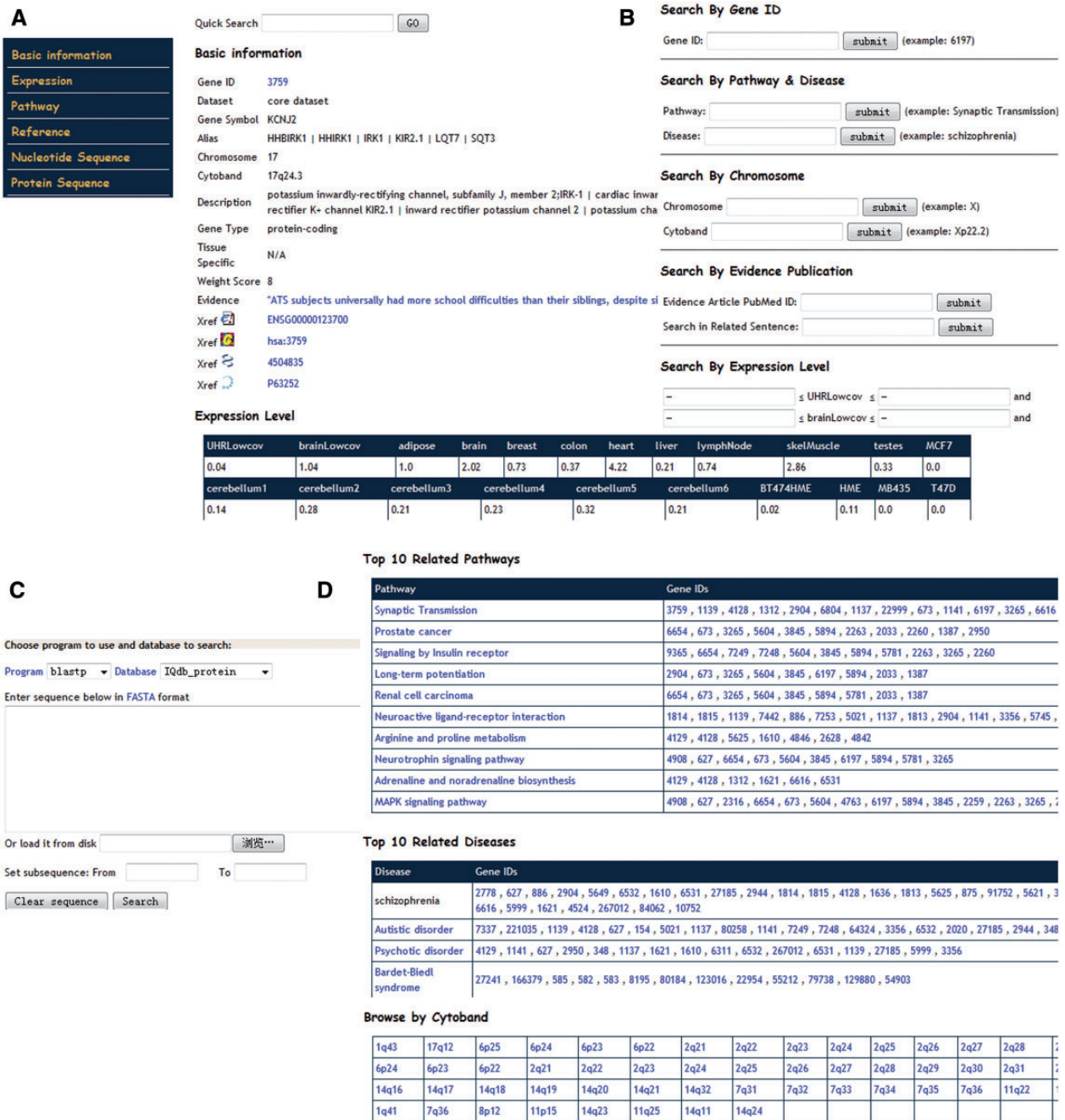
Figure 2. Web interface of IQdb. (A) The basic information in each IQ-associated gene page. (B) Query interface for text search. (C) BLAST search interface for comparing query against all sequences in IQdb. (D) Browser interface for genes in top 10 enriched pathways, top 10 enriched diseases and shared cytoband.

summary, IQdb is valuable in discovery of potential candidate genes, pathways and potential cross-talks between mental disorder and intelligence using comprehensive annotation and user-friendly interface. As a first effort to systematically collect and extend candidate IQ-associated genes, IQdb is also useful to better clarify the molecular mechanisms related to human intelligence.