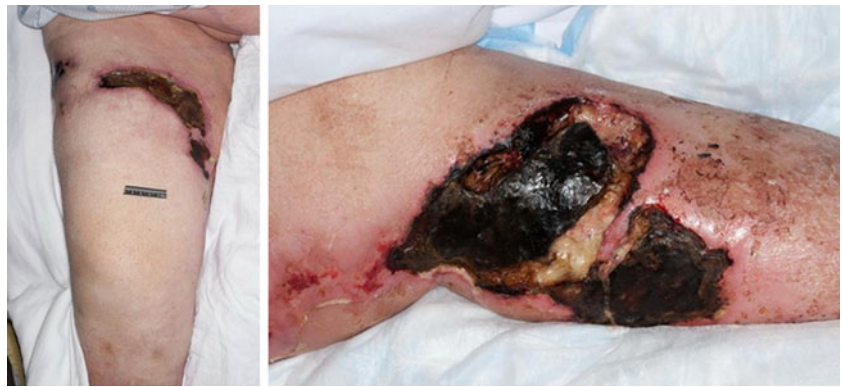
Fig. 2 Ischemic lesions of calciphylaxis in the patient's lower extremity

was unclear; a vasovagal spell was listed on her records as a potential cause. Laboratory studies during the resuscitations revealed pH 7.21, pCO 2 39 mmHg, pO 2 64 mmHg, HCO 3 15 mmol/L (AG 34), and Cr 1.9 mg/dL. She received empirical IV meropenem and vancomycin in addition to her outpatient regimen including STS for the following 2 days. Her kidney function and acidosis worsened; decision was then made to transfer the patient to our institution for further management.