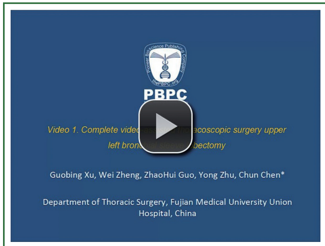
Video 1. Complete video-assisted thoracoscopic surgery upper left bronchial sleeve lobectomy.

The left upper pulmonary vein was divided. The oblique fissure