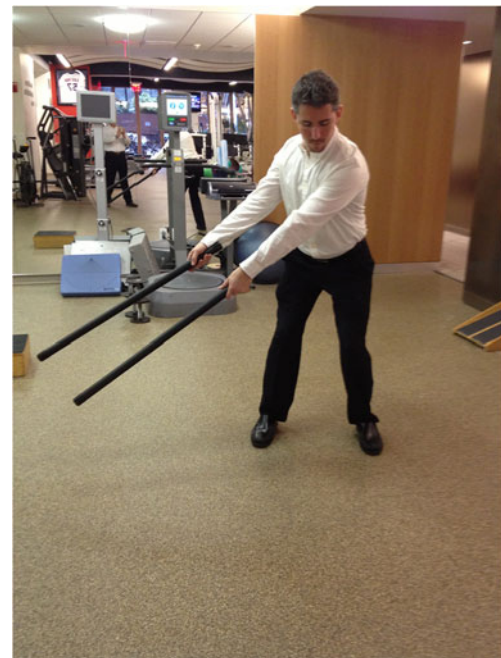
Fig. 7. Double club parallel swing. Trunk and hips remain square as clubs are rotated into backswing and follow-through by way of trunk rotation.