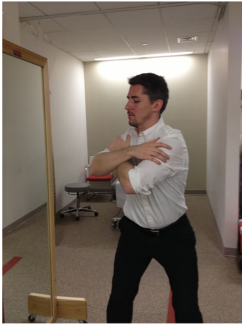
Fig. 4. Trunk on hips on trunk. Ability to rotate the trunk over the stable pelvis and the pelvis under the stable trunk.