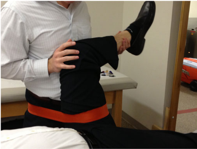
Fig. 1. Lateral hip distraction with mobilization belt.

exercise program (Fig. 2). Decreased rotation noted from the hip to the thoracic spine leads to the use of thoracic muscle energy seated to assist in firing his left serratus anterior in order to gain an increased thoracic left rotation through the muscle pull (Fig. 3.) These soft tissue techniques and mobilizations were done each PT session.