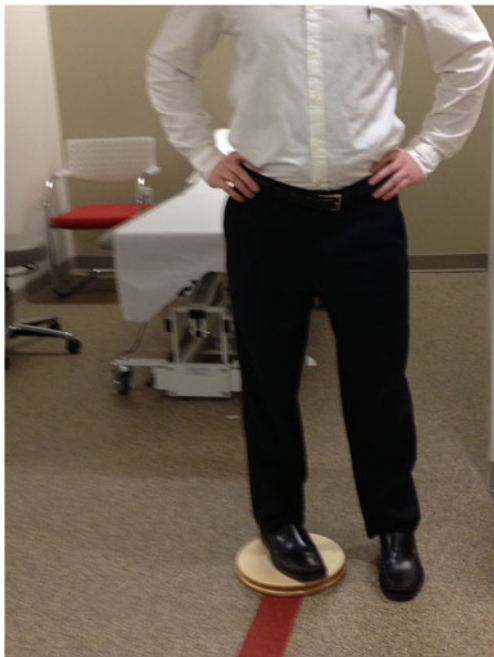
Fig. 2. Hip internal/external rotation on a swivel board. Pelvis is kept level, while lower extremity rotates on a moveable disk.

Lumbar spinal stabilization began supine and progressed to standing over the course of the PT sessions. Supine abdominal bracing was initiated to educate the patient on the proper activation of deep core musculature without spinal movement and as a basis for all future exercises [26]. Bridging, side bridges, and bird dog exercises were then initiated which have all been shown to produce deep lumbar