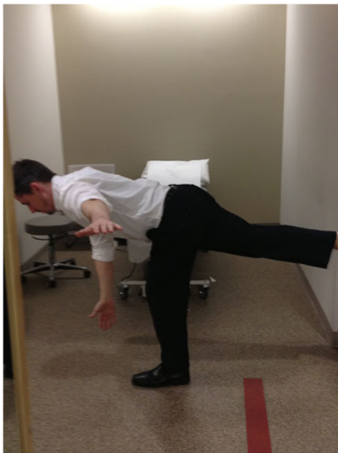
Fig. 5. Windmill. Trunk and pelvis rotating on a relatively fixed lower extremity.

arms bend and keeping his shoulders level. Once in the backswing, he initiated his left gluteal muscles to begin his downswing and rotate his body keeping his hips and shoulders level with the movement coming from his hips first. His deep core activation created rotational movements throughout his hips and trunk with decreased shear and side-bending motions occurring especially on the right lumbar spine as he