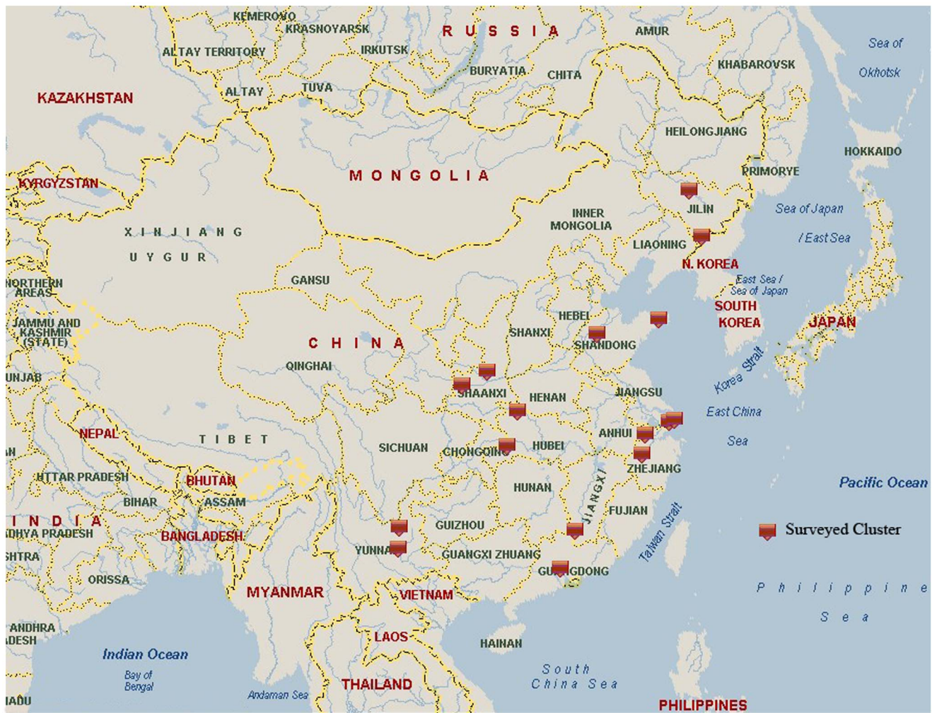
Figure 1. SAGE-China Wave 1 sample distribution. doi:10.1371/journal.pone.0074176.g001

based reporting prevalence was higher than the self-reported rates for angina (10.0% vs. 7.9%), asthma (3.9% vs. 2.0%) and depression (2.0% vs. 0.3%). The prevalence of hypertension based on measurements, was 59.7%, over two times higher than the self-reported rate (Figure 2).