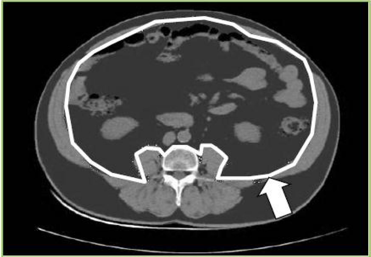
Figure 1. Measurement of VAT and SAT from CT image at L4. Adipose tissue is dark grey, white line shows delineation of visceral compartment, white arrow indicates depth of subcutaneous compartment.