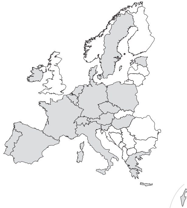
Figure 1 SHARE countries

After four waves of SHARE, more than 150 000 interviews have been conducted with about 86 000 respondents aged 50 years and over and their