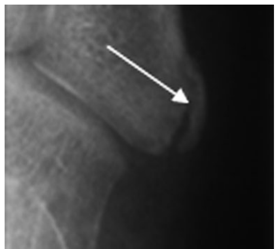
FIG. 3—Example of maturity stage 2 in a male aged 13 years. Arrow highlights the epiphysis commencing fusion to the body of the metatarsal.