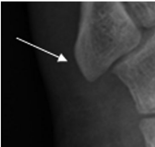
FIG. 4—Example of maturity stage 3 in a male aged 17 years. Arrow highlights completed fusion of the epiphysis to the metaphysis.

Tables 2 and 3 illustrate the percentage of each stage of ossification and fusion found within individual age cohorts and the prevalence of the epiphysis within age cohorts for females and males, respectively. The distribution of individuals shown in these tables suggests that there is a progressive pattern to the