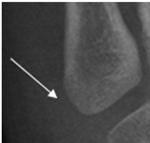
FIG. 1—Example of maturity stage 0 in a female aged 7 years. Arrow highlights region where the future epiphysis will appear.