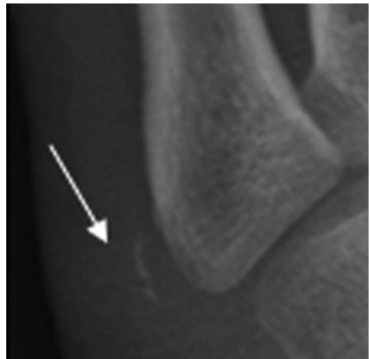
FIG. 2—Example of maturity stage 1 in a male aged 11 years. Arrow highlights the ossified flake of the epiphysis.

The suggested age range during which the epiphyseal flake at the proximal tuberosity of the fifth metatarsal appears and fuses was derived from the results of preliminary assessments carried out by the first author. Following the primary analyses, female individuals of 6 and 7 years of age, and male individuals of 8 and 9 years of age were removed from the inter-observer subsample due to the absence of ossification in the region of the proximal epiphysis of the fifth metatarsal in all individuals examined.