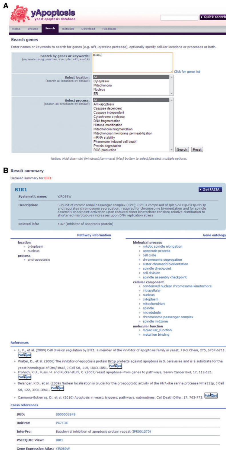
Figure 3. Screenshots of the yApoptosis web interface. (A) There are three main accessing methods: 'browse', 'quick search' and 'search'. The search interface of yApoptosis shows that the database supports text-matching with the name or keyword of a gene and filtering with pathway information. (B) The 'summary' page contains general information as described in the text (example gene BIR1).