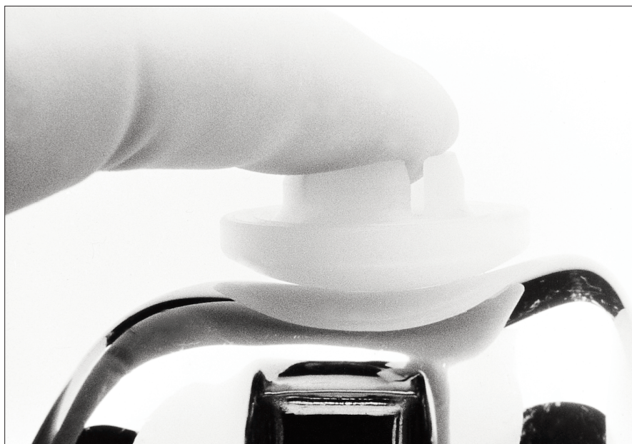
FIG. 1. A femoral component of the anatomic modular knee demonstrating the articulation with an all polyethylene patellar button. Note the conformity of the patellofemoral joint.

tral peg and were usually less than 1 or 2 mm thick (Fig. 2). For the cemented tibial component, the rate of radiolucent lines was 12%; however, only 1% of the lines were thought to be progressive, and in no instance were the radiolucent lines noted to be global or circumferential around the tibial stem. Conversely, on the lateral side, radiolucent lines under the lateral plateau were distinctly uncommon and were noted in only 5% of knees. These lines averaged 8 mm in length and 1 to 2 mm in thickness, and in no case was loosening considered to be probable or definite. There was no statistical difference in the