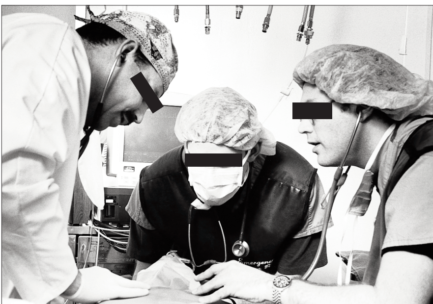
FIG. 3. A second trauma resuscitation. The chest is being auscultated. The anesthesia resident is preparing to intubate the patient.