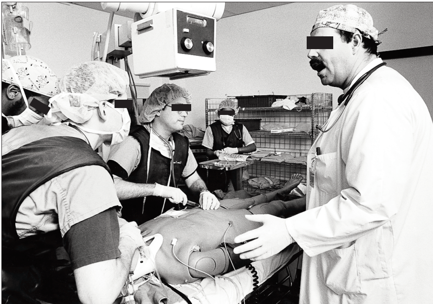
FIG. 2. A simulated trauma resuscitation. The trauma team leader (white coat) is talking to the anesthesia resident. A surgical resident is performing a percutaneous peritoneal lavage. The x-ray machine is positioned to take a chest film.

Regardless of whether a lone resuscitator or trauma-team scenario is being developed, there is a significant investment of time and energy in designing and implementing the resuscitation scenarios. It is important first to identify which specific components of the resuscitation are critical and what the desired and acceptable approaches are, as with ATLS scenarios. 3 The scenarios are written up in advance, including changes in vital signs and potential responses of the patient to a variety of different treatment or resuscitation options that may be chosen by the individual participating in the simulation. This allows the person working in the control room to appropriately change the mannequin responses (movement of upper extremities, pupillary reactivity, etc.) and the physiologic variables (i.e., heart rate, blood pressure, oxygen saturation) in response to different treatment choices. The scenarios are complete with radiographs and results of investigations that may be performed. All equipment that may be re-