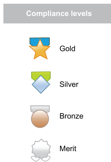
Figure 1 Nanomaterial Registry compliance medals in decreasing order of compliance score range: gold, silver, bronze, and merit.

Abbreviation: DOI, digital object identifier.