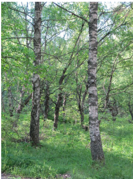
Figure 1. Mature cultivars of silver birches ( Betula pendula ) in southeastern Finland.

The seedlings were exposed to climate treatments that were designed to correspond to the scenario of an increased temperature and a doubled atmospheric CO 2 concentration in situ eastern Finland (Carter et al. 2002). These treatments prevailed in 16 outdoor chambers with the following settings: ambient temperature tracing the natural temperature outside with ambient CO 2 (=360 parts per million, ppm = μmol/mol), ambient temperature with elevated CO 2 (=720 μmol/mol), elevated temperature being +2°C higher than ambient with ambient CO 2 and elevated temperature with elevated CO 2 . Each treatment was replicated in four chambers, and each