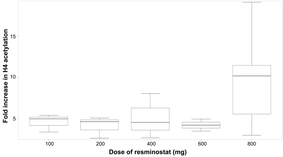
Figure 1b. Box plots of median fold increase in histone H4 acetylation in PBMC after single dose of resminostat on C1D1; maximum fold increase of histone acetylation was chosen for each patient. Dose levels 100 mg to 600 mg: N=3 each, 800 mg dose level: N=6. The lower and upper boundaries of each box define the 25th and 75th percentiles; the horizontal line in each box indicates the median; and the bars define the lowest and highest values, excluding outliers.