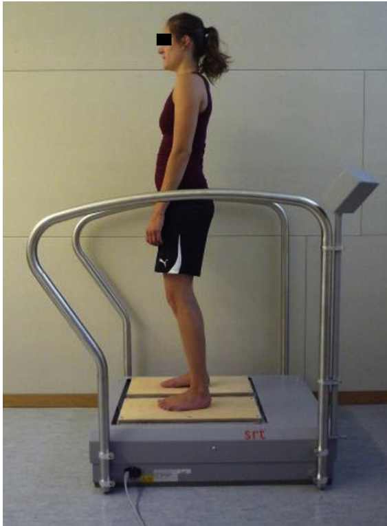
Fig. 1. Starting position on the stochastic resonance whole-body vibration training device.

low back pain episodes in the past 6 months (1 = none, 2 = less than once a month, 3 = once a month, 4 = once a week, 5 = daily).