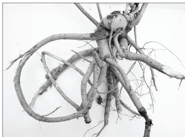
Figure 4: Root and rhizome of 3-year-old tissue culture plant from Napo County

(purchased from National Institute for the Control of Pharmaceutical and Biological Products, P.R. China) were used as the external standard. The contents of matrine and oxymatrine are shown in Table 9. The results indicated that all of the tissue culture plants showed higher matrine content than the seed plants. The highest matrine content in tissue culture plant was 1.083 mg/g from Long'an County, 47.5% higher than that of seed plant. Except for the plants harvested from Nanning, the oxymatrine content of seed plants was higher than that of tissue