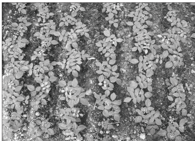
Figure 2: Rooting plantlets of Sophora tonkinensis Gapnep transplanted into a seedling bed for 2 months