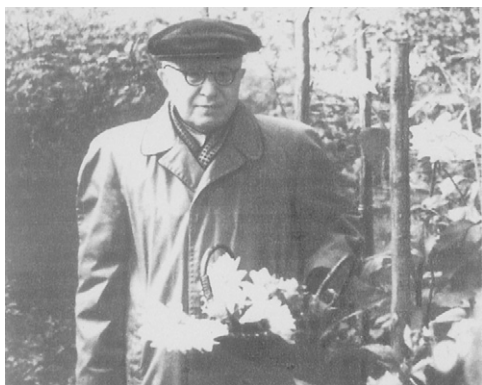
Fig. 2. Anitschkow shortly after his retirement.

What was not appreciated in Anitschkow's day was the fact that rats and dogs, unlike rabbits, are very efficient in converting cholesterol to bile acids. Consequently, even on very high intakes of dietary cholesterol, the blood cholesterol in these species does not rise appreciably. Steiner and Kendall, 33 years later, would show that first inhibiting thyroid function in dogs with thiouracil (which decreases the LDL receptor number) and then feeding them cholesterol increases blood cholesterol and induces lesions (10). So here was one reason Anitschkow's work was